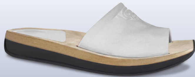
CONSTRUCTION | CEMENTED CONTOUR WOOD FOOTBED WITH DIE-CUT EVA AND RUBBER SOLE SPRINT WOOD RUNNER SS00 DSL