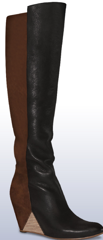
CONSTRUCTION | OVERLASTED STACKED WEDGE WITH SINGLE SOLE PYT SPLIT KNEE BOOT FW15 KLB