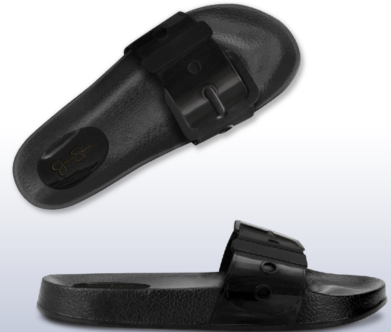
CONSTRUCTION | CEMENTED CONTOUR FOOTBED & MOULDED BUCKLE DREA MOULDED BUCKLE POOL SLIDE SS08 JS