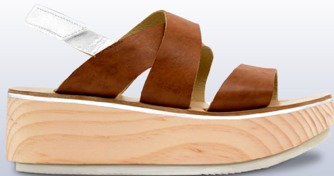
CONSTRUCTION | SLOTTED MARGAUX SLING SS15 KLB