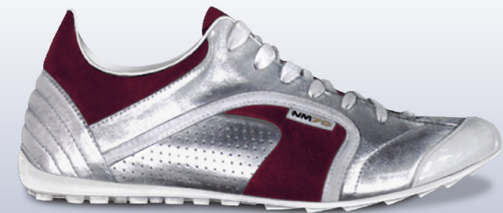
CONSTRUCTION | CALIFORNIA SLIP-LASTED W/CLEATED UNIT BOTTOM BLITZ CLEATED SNEAKER SS05 NM70