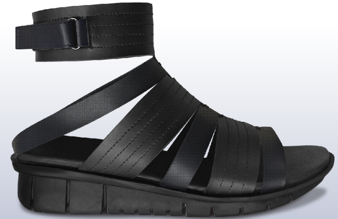
CONSTRUCTION | RECESSED PLATFORM W/PADDED FOOTBED NOAH ANKLE VELCRO SPORT SANDAL SS16 KLB