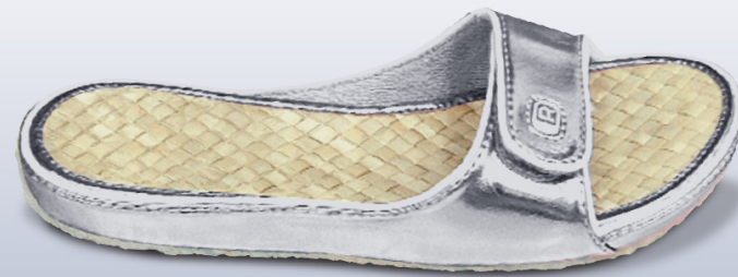
CONSTRUCTION | OVERLASTED WITH VELCRO CLOSURE LANA RATTAN VELCRO SPORT SLIDE SS05 KCR