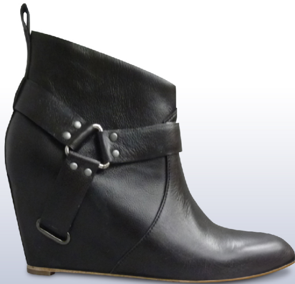
CONSTRUCTION | OVERLASTED KEYHOLE WEDGE WITH SINGLE SOLE DARSEN ANKLE HARNESS BOOT FW13 KLB