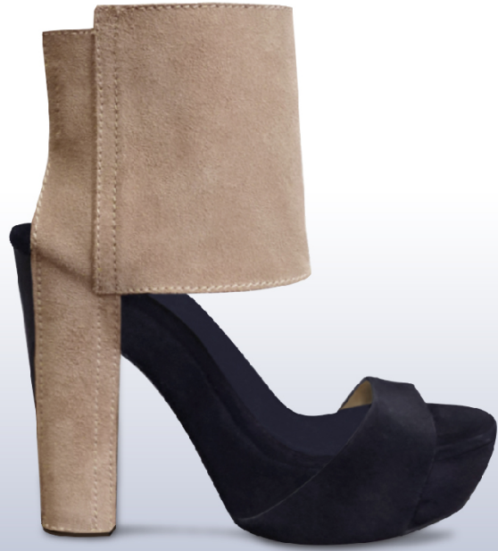
CONSTRUCTION | HEEL OVERLAY ISLAY CUFF SANDAL SS16 KLB