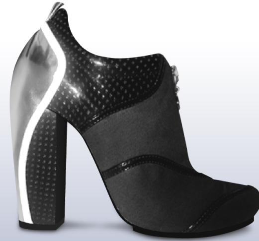
CONSTRUCTION | OVERLASTED HEEL WITH LOW FF PLATFORM LUNA SPORT ZIP PUMP JS SS08