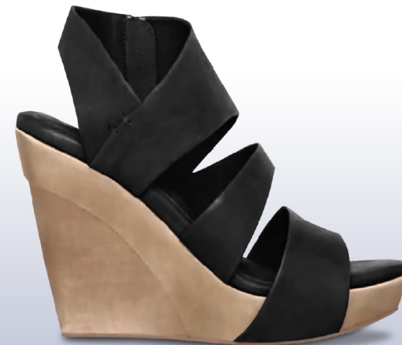
CONSTRUCTION | OVERLASTED SCULPTED PLATFORM WEDGE WAVE PLATFORM SANDAL SS10 FR